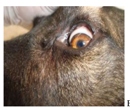
Fig.1 (A &B) A: Animal showing emaciation, dullness, dehydration and weakness. B: Paleness of ocular mucosa.