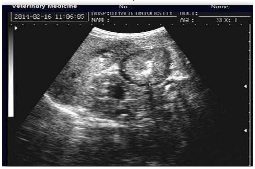
Fig.(5): Ultrasonography image (of dog liver enlarged and a large solid nodule ,rounded, outlined by peripheral hypoechonic halo apparent ,the central portion of lesion is more echogenic and measured 42x42 mm.(delineated by dotted line)

Ultrasono -graphic (US) examination was performed trans-abdominal using a real-time B-mode scanner. Liver: Hepatomegally with large nodule outlined by peripheral hypoechonic halo apparent, the central portion of lesion is more acrogenic and measured 42x42 mm as in figure (5). Gallbladder: No stone and normal size. Spleen: Normal in size, shape and echogenicity with no focal lesion appreciated. Kidneys: Both kidneys were normal in shape, size and contour. Stomach: Appeared with markedly thickened wall and normal motility.