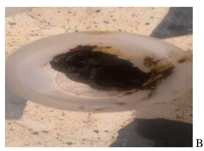
Fig.2: (A&B) A: Brownish red vomits with mucus (Hematemesis). B: Tarry black feces (Melena).