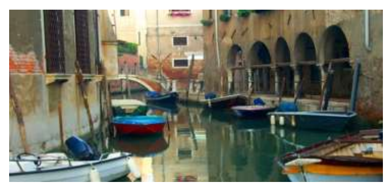
Figure (1) the influence of water baths on the architecture of buildings in Venice.

Perhaps the most important points for this studied example, is that the infinite number of visitors did not make an obstacle the conservation and improving the ancient city (M.Flamaki, 2005,62-66). Even the alleys that turn into commercial use remain extremely narrow Venice's nowadays is regarded by many as a "living museum" (Denis E. Cosgrove, 44).