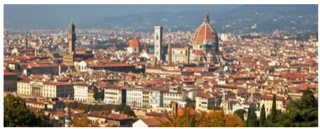
Figure (3) a general view of Florence, showing the church.

Of the most important points learned is to create a global cultural hub of art includes the cathedral and the museum, sculptures and mixes them with fine commercial.