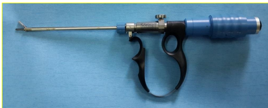
Figure 1. The harmonic scalpel used (Soring CE 0123 made in Germany)

These findings indicate that in both types of operations the operative time was longer with ligature hemostasis than with the harmonic technique (Table 1).