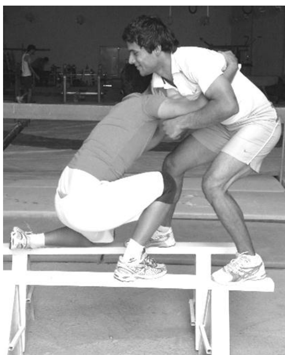
Fig (5) Exercise of third balance tool.

Stand with partner, one foot on one tool and the other on the other tool, staying balance while making grips as long as possible.