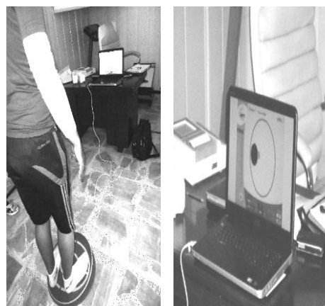
Fig (1) Balance test.

- records: researchers take only the scores which appear on the balanced program, where (6) tests scores are collected from easy to difficult without the intervention of researchers or the man responsible of the tool, grades begin from 1 and above