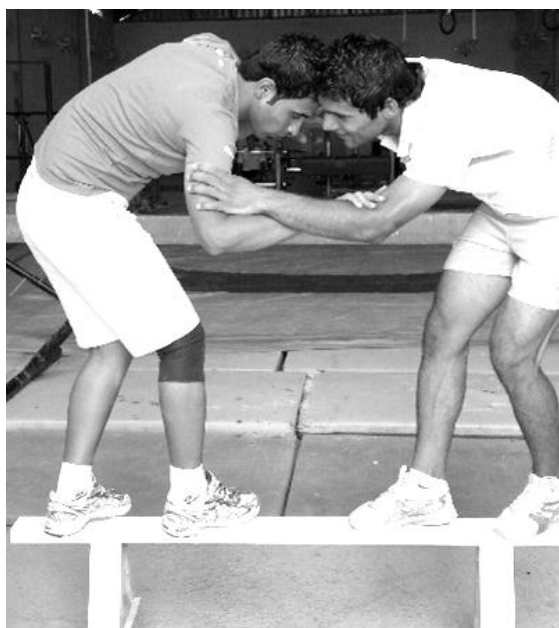
Fig (4) Exercise of second balance tool.