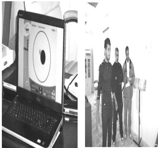
Fig (2) Software of balance test.