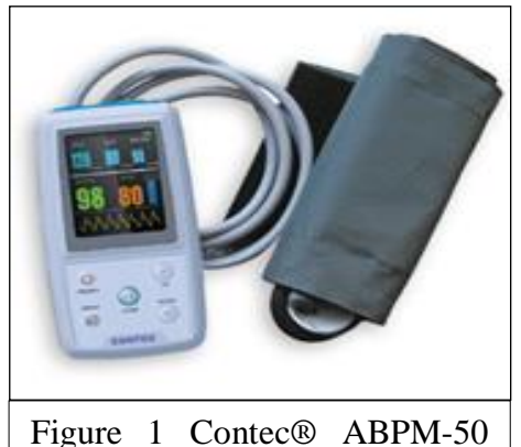
Figure 1 Contec® ABPM-5 device.

All the participants included in this study passed through three steps of clinical preparation and examinations. The first step involved refraining from tobacco, coffee, or tea intake for 30 minutes. After seating the participants for at least 5 minutes with the back supported and the arms bare and at the heart level, mercurial pressure measurement blood in а sequential manner was undertaken; the blood pressure was taken in one arm (left or right, in no special order) and then in the other arm. Three readings were taken for each arm, averaged, and kept in the database. Diabetic participants with interarm blood pressure difference of more than one mmHg and potential indications for ABPM were given an appointment for the third step that included ABPM examination.