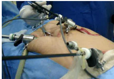
Figure 1: Insertion of condom endobag through the epigastric (retrieval ) port .

(Fig.2).The condom,while gallbladder specimen and the spilled stones were inside it, was retrieved through the epigastric port under direct vision by rail road technique (Fig.3). The condom mouth was delivered outside the abdomen through the epigastric port.The infundibulum of the gallbladder was opened, the bile in the gallbladder was sucked out, the stones were retrieved out by small sponge forceps (Fig.4). Finally, the condom with gallbladder in its lumen ,was removed out keeping the peritoneal cavity and the epigastric port clean and sterile.