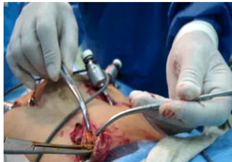
Figure 4: Retrieval of the gallstones from the gallbladder using small sponge forceps.