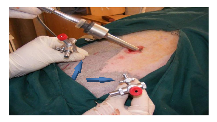
Fig.5: Shows the insertion of the ports laterally left to the umbilicus.

The abdominal cavity was explored for any obvious abnormalities. Dolphin nose dissecting forceps inserted to explore the liver and to remove any previous adhesions if found, then fixing and preparing it to partial hepatectomy Insertion of Kelly dissecting forceps, then were connected with laparoscopic electrocautery to withhold liver. The liver part which to remove was grasped by Dolphin nose dissecting forceps, then crush it on the line of resected part by Kelly dissecting forceps Multiple sparks of monopolar electrocautery(the pulsation for 5-7 seconds ) was applied until separation was performed and be sure no bleeding from the resected site. The resected part was removed, then telescope and other parts was removed. The abdominal ports incisions was closed routinely.