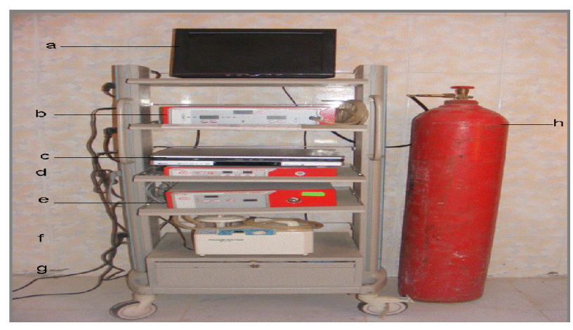
Fig.1: Shows the laparoscopic system which used in the experiment; a- Monitor. b-CO<sub>2</sub> insufflators. c- DVD recorder. d-Video lapro laparoscope. CO<sub>2</sub>