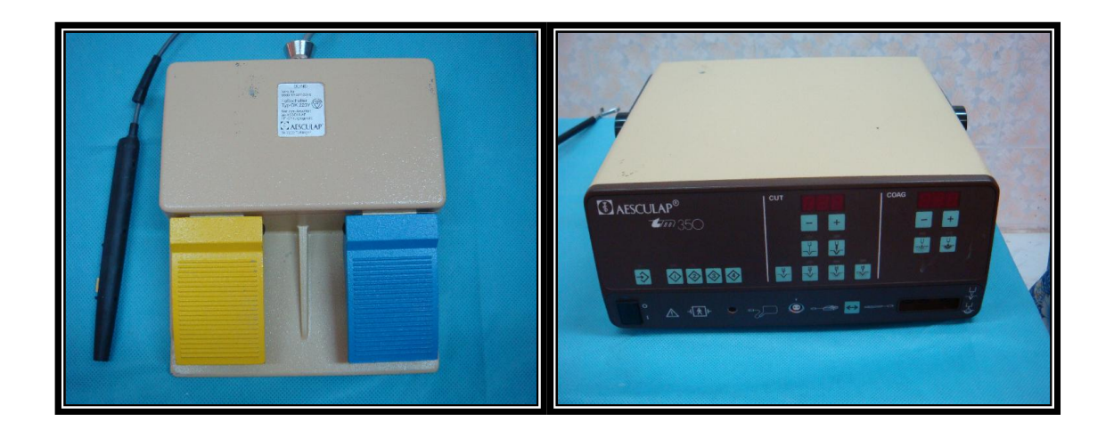
Fig. 2 - Electro Cuttery

It is an electrical device used to stop bleeding inside the abdominal cavity and during skin opening (Fig. 2) (Allgaier instrument GmbH Company, Germany).