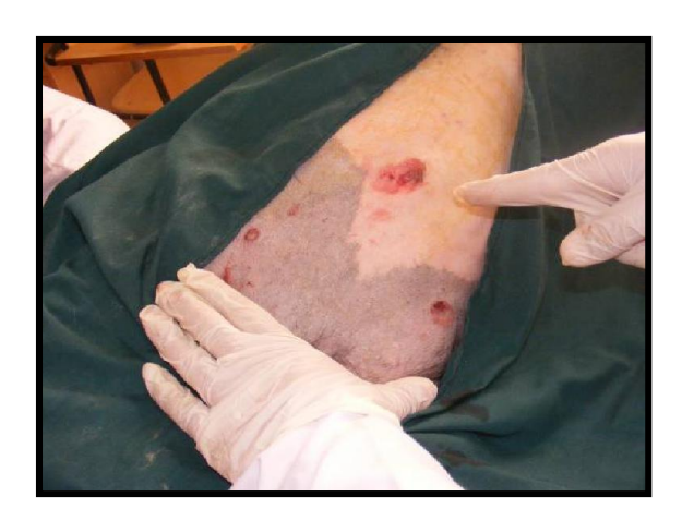
figure 6: size of incision of laparoscopic surgery

The Hematological parameters showed no significant increase in Hb,PCV number at day1,2,3 after the surgery Table 3 .From the results of this study, it was concluded that the laparoscopic partial hepatectomy surgery was successfully done in goats without adverse effect on the animal's health. The result also showed that the laparoscopic partial hepatectomy can be easily done in goats without any complications.